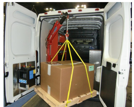
STEP 2 Lift & Rotate