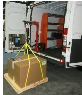
STEP 1 Secure