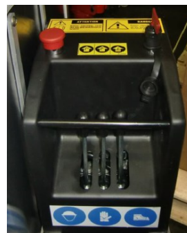
Control Valve Bank