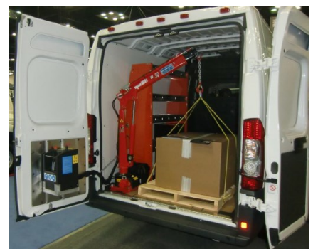
STEP 3 Position